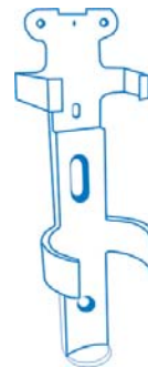
EZ Snap Bracket