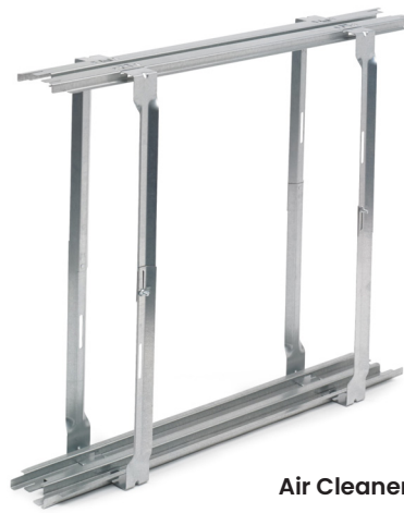
Air Cleaner Adjustable Rails