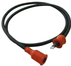
Straight Female 1/4 x 1/4 or Female 1/4 to Rajah WHA40A-600H thru -607H