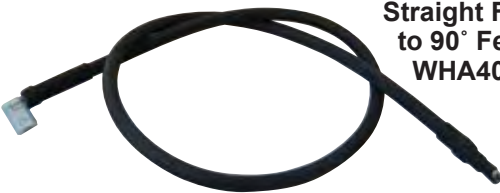
Straight Female 1/4 to 90° Female 1/4 WHA40A-609H