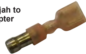
RAA1600A-601 Rajah to 1/4" Female Adapter