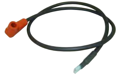
Straight Female 1/4 to 90° Rajah WHA40A-610H