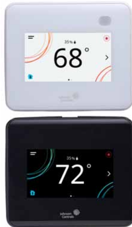
Figure 1: TEC3000 Color Series Thermostat Controller shown with and without occupancy sensor in white and black enclosures

A bright, high-definition capacitive touchscreen display provides responsive feedback and improved readability of text and icons. The home screen is configurable to Modern and Classic, and Light and Dark themes.