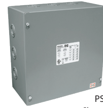
PSH500A Shown With Cover