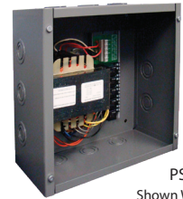
PSH500A Shown Without Cover