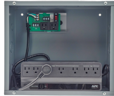
Shown Without Cover