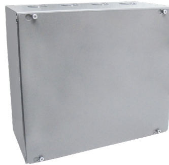
Shown With Cover