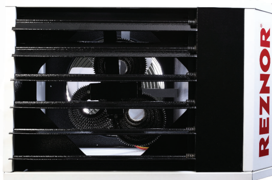
Electric Unit Heater (Model EUH)