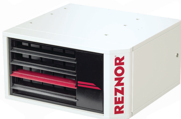
Universal Unit Heater (Model UDXC)